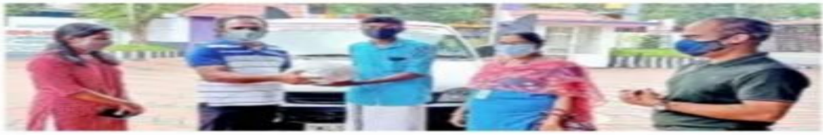
വിടിബി കോളേജിലെ എൻഎസ്എസ് യൂണിറ്റ് അവശ്യവസ്തുക്കളുടെ കിറ്റ് കമ്പഴിപ്പോം പാലിയേറ്റീവ് കെയറിന് നൽകുന്നു